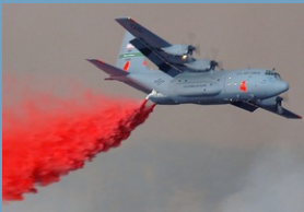
C-130E + MAFFS