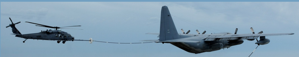
MC-130P + HH-60G